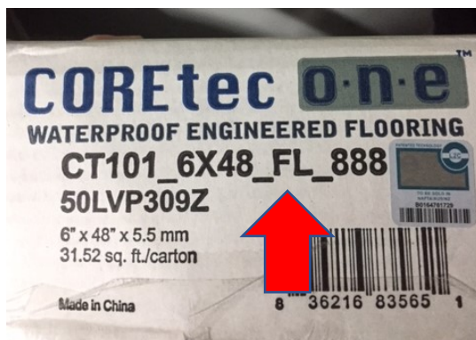
New Standard Unilin "FL"

The New Standard product has been improved; with these improvements, Beaulieu has decided to change the locking system from the Unilin locking system, labeled FL on the boxes to the Valinge 2G locking system, labeled FV on the boxes. While the Unilin system is a good product, Beaulieu is always striving to have the best products possible. The Unilin product had an Angle/Tap locking system; this locking system created an additional step for the installer. The Valinge 2G system will eliminate the step of tapping the end locks together. This will save on installation time for the installers.